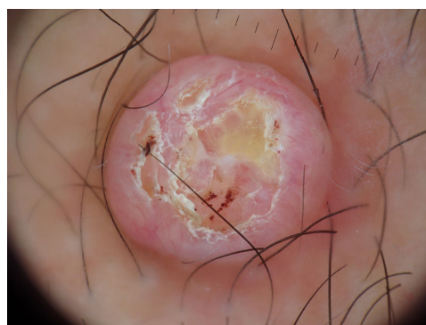
Figure 3 Dermoscopic image of the lesion.