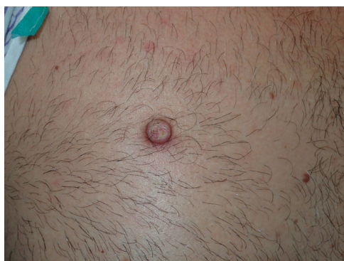
Figure 1 Macroscopic appearance of the lesion.

Physical examination revealed a solitary tumor of 15 mm in diameter located on the chest. The lesion was similar in color to the surrounding skin, and had a firm consistency with a keratotic, crateriform center (Fig. 1).