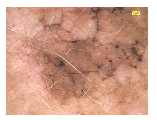
Figure 4 Melanoma in situ with angulated lines, defined as pigmented lines forming a rhomboid or zig-zag pattern.

lymph node (SLN) positivity in melanoma, found that ulceration, blotches (homogeneous hyperpigmented areas), and absence of a pigment network were correlated with a positive SLN biopsy.