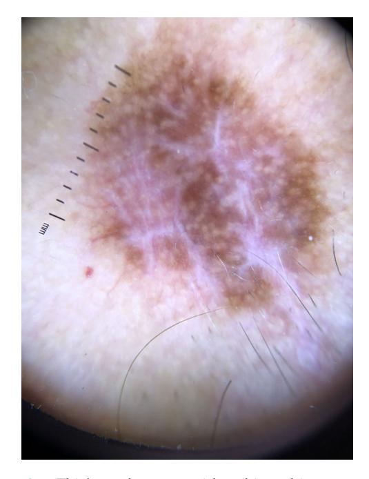
Figure 2 Thick melanoma with white shiny structures, defined as thick, linear, white structures dispersed in an orthogonal or stellate pattern.

Dermoscopy is a cost-effective tool for diagnosing pigmented skin lesions and it is 10% to 27% more sensitive for the diagnosis of melanoma than naked eye examination. The findings of a number of studies that have analyzed the influ-