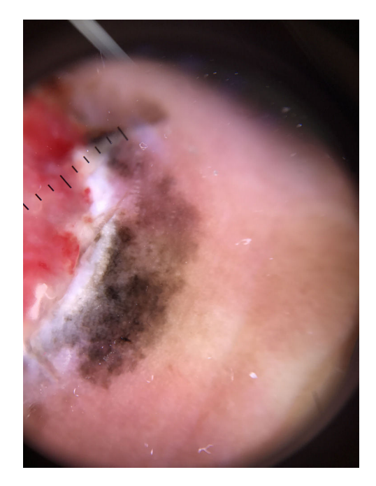
Figure 3 Thick melanoma with milky-red areas, defined as fuzzy or unfocused milky-red globules and/or larger areas.

ence of Breslow thickness on dermoscopic features<sup>5-8</sup> point to a possible association in melanomas on glabrous skin.