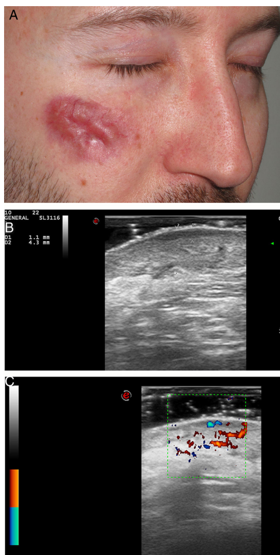
Figure 1 Granuloma faciale. A. Case 1: erythematous-violaceous plaque on the right cheek. B. Hypoechoic, heterogeneous lesion in dermis and hypodermis, measuring 4,3 mm thick. Note the subepidermal hypoechoic band (22 MHz probe, B-mode). C. Increased vascularity on color Doppler mode.

probes. All the sonographic examinations were performed by following published guidelines for studying dermatologic lesions that include grayscale and color Doppler imaging. 3 All patients gave oral and written consent for inclusion in the research and for publication of images.