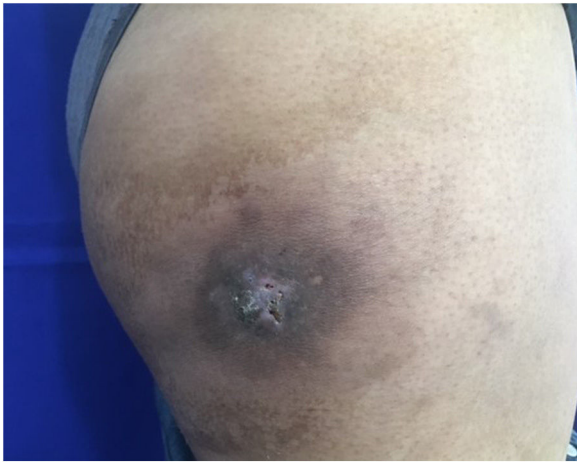
Figure 3 90% reduction in the skin lesion.

Ewing's Sarcoma is a primitive neuroectodermal tumor that rarely occurs in the skin and subcutaneous tissue. 85% of tumors present EWSR1 gene fusion with an erythroblastosis virus-transforming gene (FLI1); the fusion of exon 7 from EWSR1 to exon 6 of FLI1 translocation is specific to Ewing's Sarcoma. 1 In general, it is better known as a primary bone tumor with a higher incidence in children than in adults. It is the second most common primary bone tumor in children and adolescents. 2,7 Ewing's sarcoma has a low frequency, described mostly in the deep soft tissues of the paraspinal region, the chest wall or the lower extremities. The most superficial cases, called cutaneous, are sporadic and the vast majority of these have been reported as a single, small mass. 1,2