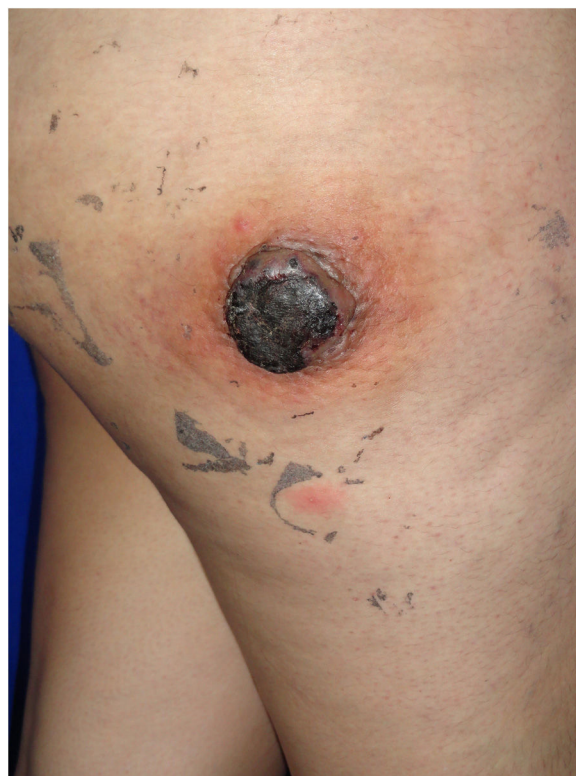
Figure 1 5-cm firm erythematous mass.

A punch biopsy was performed showing a basophilic small-cell tumor, with scarce cytoplasm, prominent nucleus, and chromatin, cells arranged in blankets throughout the thickness of the dermis without epidermal compromise (Fig. 2). Immunohistochemical study was positive for CD99, PKC, and Vimentin; and negative for actin, desmin, S100, chromogranin, CD20, CD3 and CK20. Thoracic CT revealed a 5 mm solid non-calcic nodule at the base of the left lung, suspected as metastasis, and left pachypleuritis. Abdominal CT showed hepatomegaly at the expense of the right lobe, without dilatation of bile ducts, no solid or cystic masses in the parenchyma where shown. Splenomegaly with a hypodense heterogeneous image, no greater than 25 mm was found, also suspected as metastasis. A diagnosis of Primitive Neuroectodermal Tumor: Ewing's Primary Cutaneous Sarcoma was given. The patient was referred to a social-security hospital where she received one induction cycle with vincristine and doxorubicin obtaining 50% reduction of the mass. Following two cycles without vincristine because