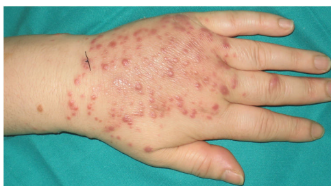
Figure 1 Multiple erythematous-violaceous papules of 3–4 mm on the back of the left hand.

Biopsy revealed an epidermis with acanthosis and isolated apoptotic keratinocytes, band-like inflammatory infiltrate, and basal vacuolar damage. Well-defined granulomas consisting of histiocytes and lymphocytes were observed