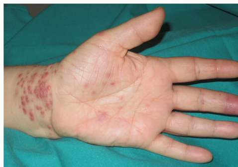
Figure 2 Similar lesions on the palm and wrist of the left hand, and an erosion on the palmar aspect of the third finger of the same hand.

in the reticular dermis and hypodermis (Fig. 3A). Giemsa, periodic acid-Schiff, and Grocott silver staining were negative for microorganisms. Fite-Faraco staining revealed the presence of acid-alcohol resistant bacilli (Fig. 3B).