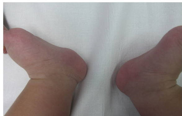
Figure 1 Clinical image of a fibrolipomatous hamartoma in a 5-month-old girl. The image shows a flesh-colored tumor with a soft consistency on the precalcaneal region of the left heel.

Skin imaging with high-frequency ultrasound is increasingly used in childhood dermatologic diseases. The differential diagnosis of tumors is one of its main applications. Unlike tumors, hamartomas appear as thickening of the dermis and/or subcutaneous cellular tissue and not as masses. The echogenicity of a hamartoma depends on the most abundant element. In the case of CFH, the reticular dermis thickens owing to the presence of islands of fatty tissue between collagen fibers that can extend to the hypodermis. Ultrasound reveals hypoechoic islands surrounded by hyperechoic bundles in the deep dermis and in the subcutaneous cellular tissue. The literature contains few references to ultrasound assessment of CFH. Cambiaghi et al. 5 present a series of 3 cases and report on the usefulness of ultrasound in the differential diagnosis, although they do not describe or present their imaging findings. Grilo et al. 6 describe CFH as a poorly