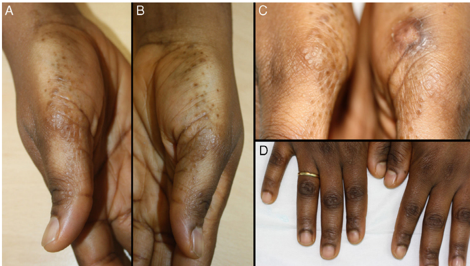
Figure 1 A-C, Minute symmetrically arranged flesh-colored hyperpigmented papules with a shiny surface that is lichenoid in appearance, some of which are umbilicated. D) Hyperpigmentation of the interphalangeal joints with characteristic lesions.