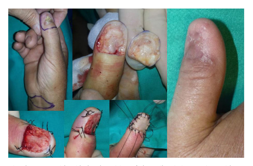
Figure 2 Case 10. Functional surgery with wide local excision of the nail unit in a patient with a moderately differentiated subungual squamous cell carcinoma with a thickness of 4 mm and extensive onychodystrophy of the right thumb. Result after 6 months.

Over the 10-year period, 11 MSUTs (7 SUMs and 4 SUSCCs) were excised from 5 women and 6 men, all white, aged between 45 and 81 years (mean age, 61 years). The clinical characteristics of the patients (Figs. 4 and 5) and the excised tumors are shown in Table 1. Mean time from onset of symptoms to diagnosis was 35.1 months (range, 6-120)