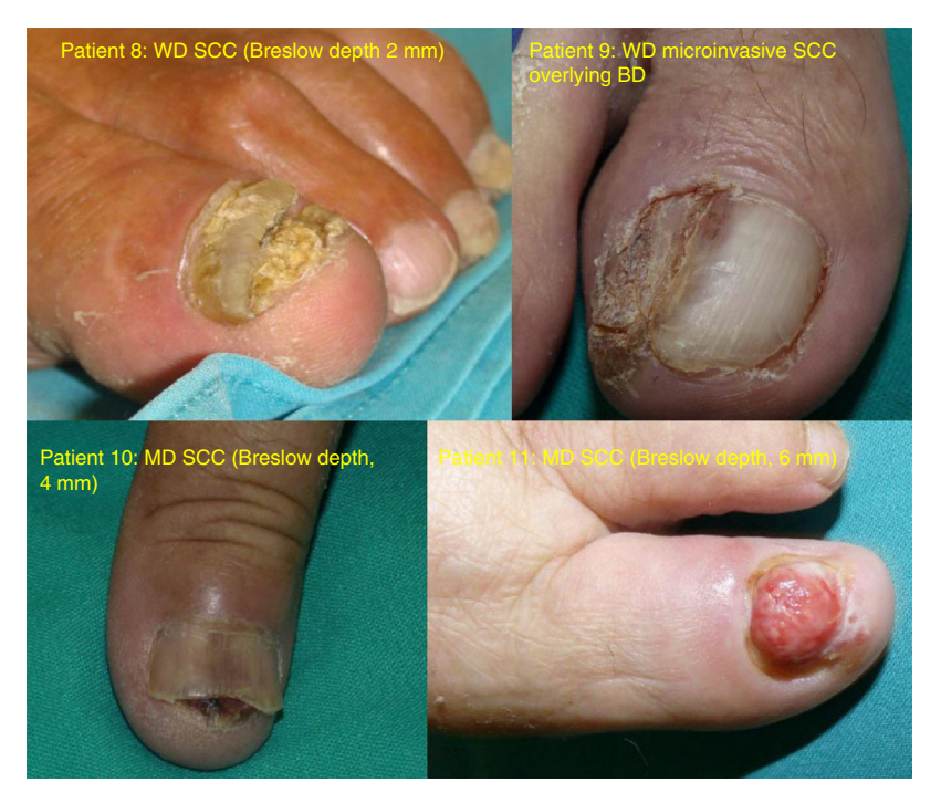
Figure 5 Photographs of the 4 subungual SCCs. MD indicates moderately differentiated; SCC, squamous cell carcinoma; WD, well-differentiated.