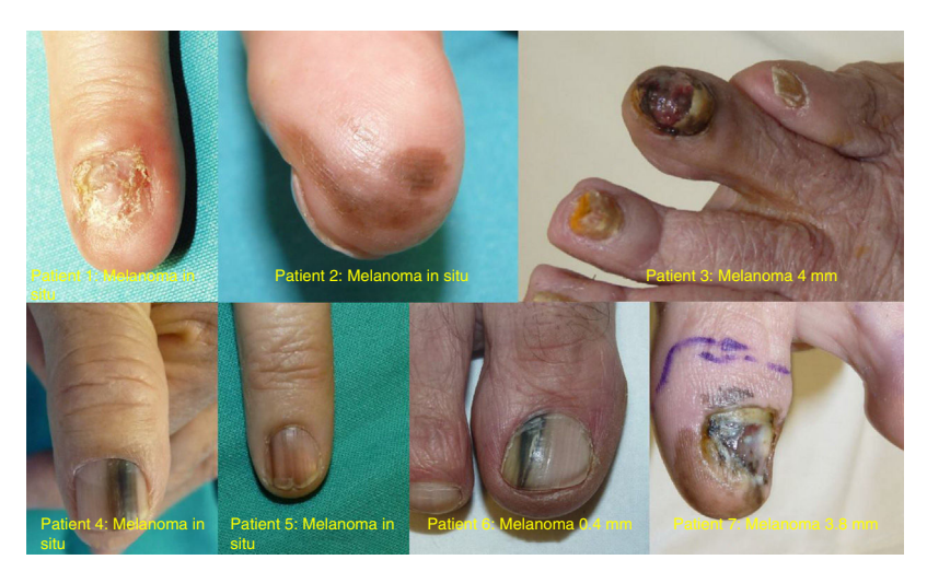
Figure 4 Photographs of the 7 subungual melanomas in our series.

months). This time was similar for SUMs (37.1 months) and SUSCCs (31.5 months). Diagnosis was confirmed by biopsy in all cases, and the 4 patients with SUSCC additionally underwent bone radiography, which was normal in all cases.