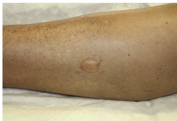
Figure 1 Patient 3: medium-sized blister containing serous fluid on the inner aspect of the right leg.

Samples for histopathology were acquired from 2 patients. Blister samples were collected for hematoxylin-eosin staining and healthy perilesional skin samples for analysis by direct immunofluorescence (DIF). In both patients, histopathology showed a subepidermal blister with fibrinoid deposits on the dermal floor and mild inflammatory infiltrate (Figs. 3A and 3B). Devascularization of the basal layer and keratinocyte necrosis were evident in the detached epidermis (Fig. 3C). The results of the DIF study were negative for both patients (Fig. 3D). Analyses requested for