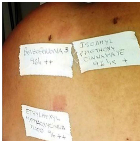
Figure 5 Reactions in the irradiated area to oxybenzone and to 2 cinnamates, thus confirming PACD to organic sunscreens. These were replaced by physical sunscreens.

Oxybenzone is a compound that absorbs in the range 290-340 nm and is widely used in cosmetics, as well as in industrial products (Fig. 5). This aromatic ketone is soluble in organic solvents and insoluble in water. It can cross the skin barrier and its metabolites are excreted in urine after extensive topical application. 19 It was named allergen of the year in 2014 by the American Contact Dermatitis