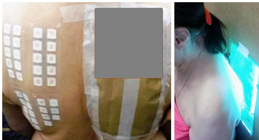
Figure 3 Placement of the sets of skin patches (left) and subsequent irradiation at 48 h (right).