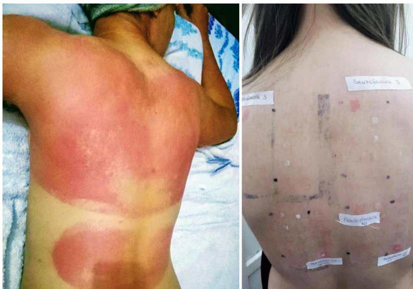
Figure 4 Patient with photosensitive reaction after exposure to sunlight with pediatric sunscreen. Patient with a history of intolerance to cosmetics. After the test, the patient had a photosensitivity reaction to benzophenone-10 and reaction in the irradiated area and nonirradiated area to benzophenone-3, both of which are components of the sunscreen.

patch test without irradiation. 14 The authors believed that in countries such as Belgium, France, Spain, and Italy, the rates of sensitization to octocrylene are higher because of the more frequent use of topical ketoprofen, which may act as a sensitizer and in turn generate cross reactions. Thus, an increase of 0.7% is observed in ACD and 4% in PACD to octocrylene in the patients studied, but this agent is not considered a main sensitizer.