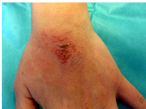
Figure 3 Eczema on the dorsum of the nondominant hand of a patient who reported using this area to wipe off the finger of the dominant hand, which she used to remove excess polish around the edges of the nails.

Both of these innovations can be used with either conventional or permanent nail polish.