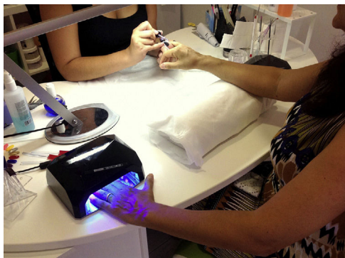
Figure 1 A beautician applies permanent nail polish at a work station equipped with 2 lamps (1 on each side of the customer). Note that the thumb of the left hand is not under the lamp. In order for acrylate to polymerize properly, the thumb must later be placed under the light separately.