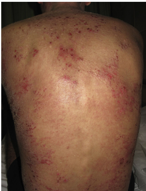
Figure 1 Severe atopic dermatitis. Note the multiple erosions, excoriated papules, and marked xerosis on the back.

Topical crisaborole 2% is a nonsteroidal anti-inflammatory drug that inhibits phosphodiesterase (PDE) 4 (mainly PDE4B), reducing the release of proinflammatory cytokines, such as tumor necrosis factor, IL-12, and IL-23. Two clinical trials in patients older than 2 years with mild to moderate AD, AD:301 (n = 763) and AD:302 (n = 764), found crisaborole to be superior to placebo in terms of reducing IgA after 28 days (AD:301: 32.8% vs. 25.4%, P = .038 ; AD:302: 31.4% vs. 18.0%, P < .001 ) and improving pruritus. 3 In addition, adverse effects were minimal.