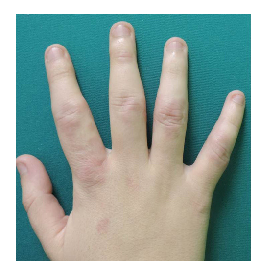
Figure 2 Granuloma annulare on the dorsum of the phalanges of the right hand.

methotrexate, drug-induced sarcoidosis, and drug-induced {\sf GA}.