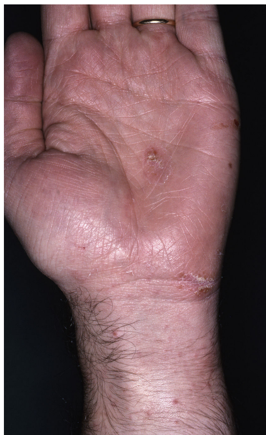
Figure 1 Scabietic burrows and nodules in volar surface of the wrists.

Within twenty-four to seventy-two hours after the administration of oral ivermectin, eleven patients (47.8%) presented new cutaneous lesions that were clinically distinct from those characteristic of scabies. The skin eruptions appeared after receiving the first oral ivermectin dose in 9 patients, after receiving the second dose in 1 patient, and after both the first and second dose in 1 patient. In all of the cases, the eruptions were characterized by itchy, scaly erythematous eczematous plaques located on the trunk and