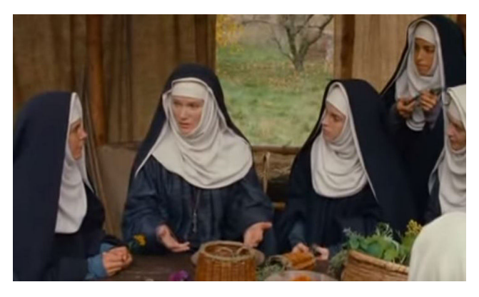
Figure 4 Scene from Vision , the 2009 film about Hildegard of Bingen, directed by Margarethe von Trotta. Abbess Hildegard explains the properties of medicinal plants to her disciples.

Yarrow (Fig. 3d), a medicinal plant used to treat wounds, is associated with carpenters in Galicia, <sup>17,18</sup> quite probably because they applied it often to treat workplace-related injuries. Hildegard used it to treat wounds and prevent gangrene. She directed the caregiver to wash the wound with wine and cover it with a poultice of the plant wrapped in a cloth. A millefolium has recently been studied as a treatment for injuries caused by radiotherapy, such as chemotherapy-associated mucositis, as a stimulus of fibroblasts and as an immunomodulator. <sup>19–22</sup>