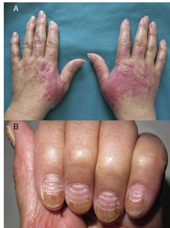
Figure 1 Periarticular thenar erythema and onycholysis syndrome: Docetaxel-induced skin and nail changes. A, Patient 1. Erythematous-violaceous plaques on the dorsum of the hands and over the proximal phalanx. B, Nail changes in patient 3: parallel Beau lines and onycholysis of the distal third of the nail plate.

The 3 patients were women aged 35, 56, and 68 years, with infiltrating ductal adenocarcinoma of the breast on adjuvant treatment with docetaxel and cyclophosphamide (Table 1). They sought dermatologic evaluation for the appearance of painful erythematous-violaceous plaques with fine superficial desquamation on the dorsum of both hands (Fig. 1A). The lesions interfered with their activities of daily living. The lesions had arisen 3 to 12 days after the administration of chemotherapy, and showed a clearly progressive deterioration with each cycle, despite the use of topical corticosteroids. Associated nail involvement in the 3 cases varied from fine parallel Beau lines and subungual splinter hemorrhages to frank distal onycholysis of the nail plate (Fig. 1 B). Physical examination revealed no lesions on the rest of the skin, and the patients presented an otherwise good general state of health. Histology of a 4-mm punch biopsy from the dorsum of the hand of patient number 2 revealed a hyperkeratotic epidermis with parakeratosis, necrotic keratinocytes, focal vacuolar degeneration of the basal layer, and a band-like perivascular lymphocytic inflammatory infiltrate with occasional eosinophils (Fig. 2, A