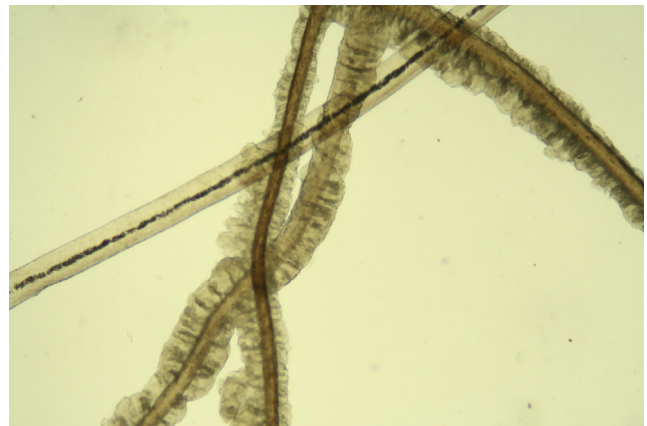
Figure 3 Mucoid sheaths around the hairs. Potassium hydroxide, original magnification x40.

In trichomycosis, dermoscopy reveals yellowish-white masses with a waxy appearance, adherent to the hair. The dermoscopic findings in our patient were similar to previous reports, and some authors have used the term feather sign or brush sign. 7,8 Concretions with the appearance of a rosary of crystalline stones have also been described. 9