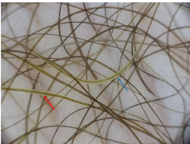
Figure 2 Dermoscopy revealing irregular masses around the hair. The feather sign (red arrow) and the brush sign (blue arrow) are visible.

Dermoscopy is a simple technique for all dermatologists. Initially it was used to study melanocytic lesions, but more recently it has also been used to facilitate the diagnosis of nonmelanocytic lesions and of inflammatory and infectious diseases. The dermoscopic characteristics of dermatoses that affect the hair, such as pediculosis, pseudofolliculitis, and alopecia areata have already been described. 5,6