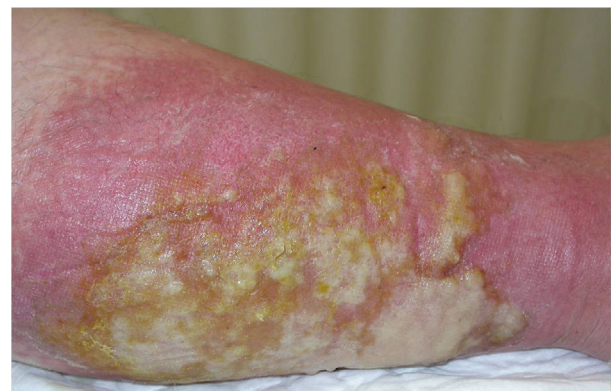
Figure 3 Hot erythematous plaque on a leg, with blister formation and an abundant exudate.