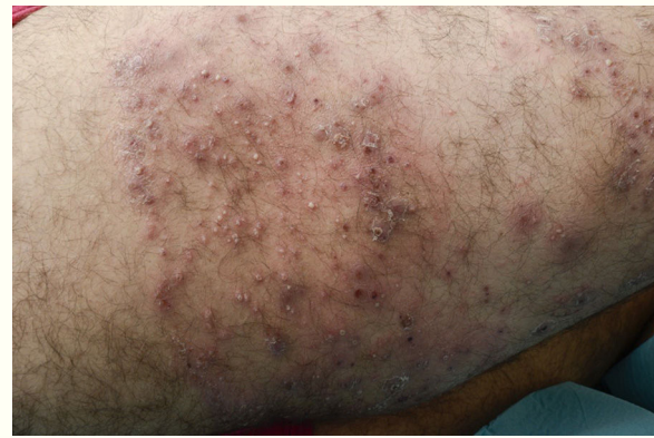
Figure 2 Case 2: erythematous plaques, follicular pustules and nodules in the right lower limb.

A 37-year-old Caucasian male presented with a 2-month history of an annular plaque on the hypogastric area. He was treated with topical triamcinolone acetonide and econazole nitrate combination for suspected tinea corporis. The patient developed painful erosions with yellowish crusts shortly after he shaved the area and he was treated for herpes simplex infection and Impetigo with acyclovir and flucloxacillin lately changed to clindamycin without showing any improvement. The lesions progressed to ulceration and the patient developed malaise and intense pain which impeding walking (Fig. 1A). He was admitted to the dermatology ward with the suspicion of pyoderma gangrenosum. On examination he presented with a 15 cm infiltrated ulcerated plaque at the hypogastrium with satellite follicular pustules and nodules on the abdomen and the legs. Inguinal lymph node enlargement was present. Punch biopsies of the pustules and the ulceration were performed. Examination showed intense perifollicular suppurative inflammation, with the presence of neutrophils in the deep dermis and subcutaneous tissue. Periodic acid Schiff (PAS) and Grocott staining showed the presence of fungal spores in the hair follicle (Fig. 1B) and Trichophyton mentagrophytes was isolated from culture of the skin scrape with hair shaft. He was treated with prednisolone 60mg daily, with gradual tapering, and terbinafine 250mg daily for 8 weeks with