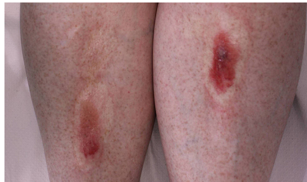
Figure 1 Bilateral atrophic plaques with overlying blisters.

We have also found cases with 2 or more coexisting bullous diseases, such as pemphigus vulgaris, epidermolysis bullosa, and porphyria cutanea tarda; these diseases were ruled out in our patient. 3,10 Likewise, scleroderma-like changes are recognized in