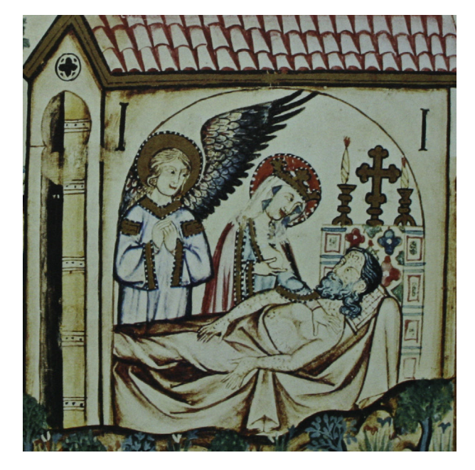
Figure 4 The man described in Cantiga 93 suffered from a disease that caused skin lesions. Note how they are depicted as generalized plaques or crusts that might correspond to psoriasis or eczema. The Virgin uncovers her breast and sprays her milk onto the patient's skin.

The illustration that accompanies the cantiga (Fig. 4) shows a man in bed prostrated by disease yet joyful in his