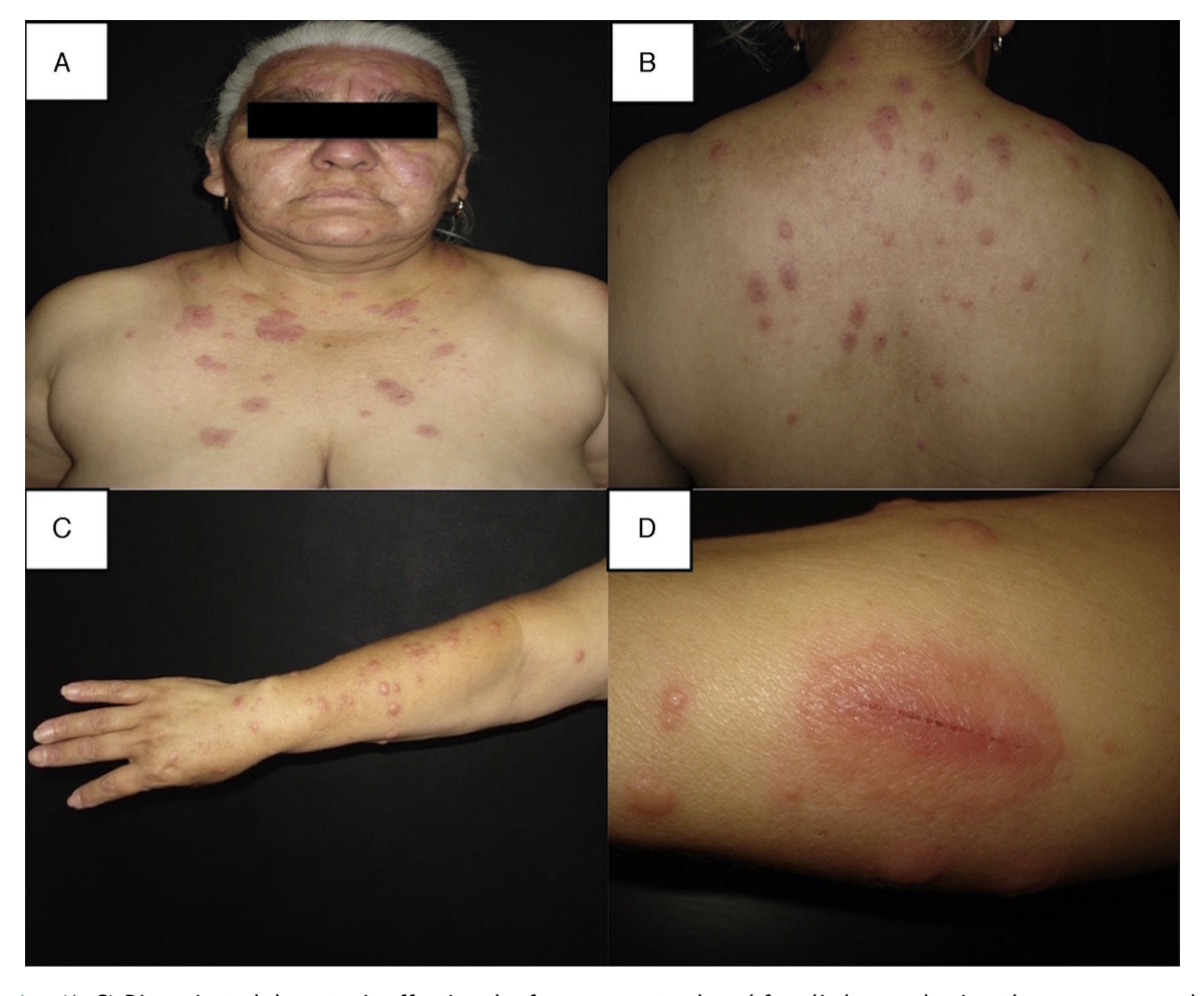
Figure 1 (A-C) Disseminated dermatosis affecting the face, upper trunk and four limbs, predominantly on sun-exposed areas, bilateral and prone to symmetry, polymorphous, characterized by erythematous, thick, sharply demarcated nodules and plaques, and some yellow pustules between them. (D) Pathergy phenomenon.

In classical: The presence of both major criteria (1 and 2) and two minor criteria (3–6) is needed to establish the diagnosis of classical Sweet's syndrome. In malignancy-associated: the patients must precede, follow, or appear concurrent with the diagnosis of the patient's neoplasm and classical Sweet's syndrome diagnostic criteria. In drug-induced: All five features should be present to diagnose Sweet's syndrome. Adapted from Cohen et al.<sup>7</sup>