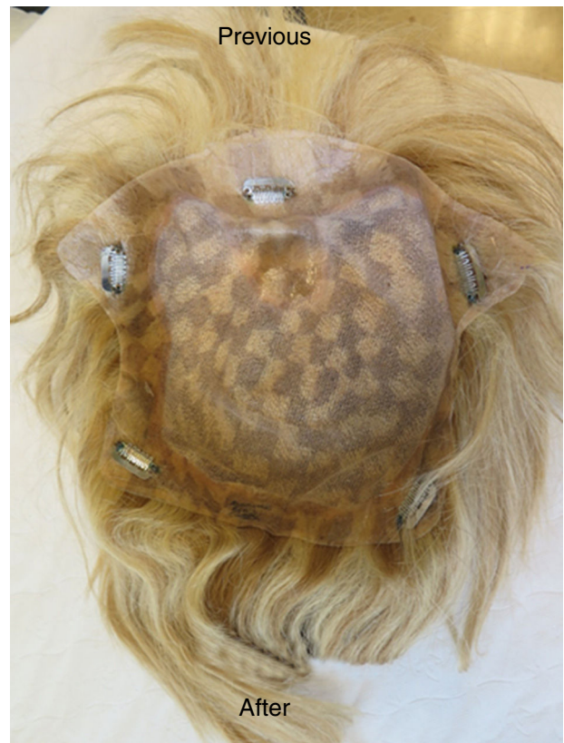
Figure 3 The underside of the wig with 5 fasteners.

The following differential diagnoses should be considered: