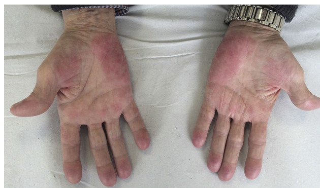
Figure 1 Erythema and mild desquamation on the palms.

We report the case of a 69-year-old man diagnosed in 2012 with stage IV rectal adenocarcinoma with liver and lung metastases and wild-type K-RAS, for which he had received chemotherapy according to the XELOX-Avastin treatment regimen (capecitabine, oxaliplatin, and bevacizumab), with progression in the liver after 13 cycles of treatment. He subsequently received treatment with FOLFIRI-Erbitux (irinotecan, 5-fluorouracil, and cetuximab), with progression in the liver and lungs after 12 cycles. Grade 2 palmar-plantar erythrodysesthesia occurred as a side effect and was initially attributed to the capecitabine treatment. When only residual erythema remained on the palms and soles, the lesions reappeared after the introduction of 5-fluorouracil. The patient also had grade 2 neuropathy, secondary to the oxaliplatin treatment, which persisted at grade 1 at the start of the regorafenib treatment. Two months later, in light of the progression of the disease with FOLFIRI-Erbitux treatment, treatment with regorafenib was started at a dose of 160 mg/d. At 2 weeks, the patient reported an increase in erythema on the palms and soles and the appearance of keratotic lesions on the weight-bearing surfaces of both feet (Figs. 1 and 2). Physical examination revealed poorly defined areas of erythema on the palms, with more intense involvement of the thenar and hypothenar eminences (Fig. 1), and erythema with diffuse