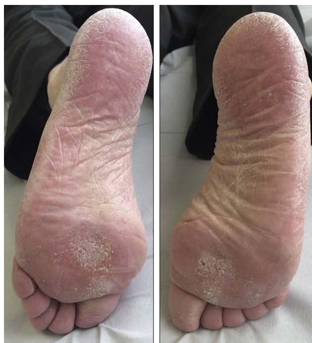
Figure 2 Hyperkeratotic papules on weight-bearing surfaces of the balls of the feet.

desquamation that covered practically the entire surface of both soles, with keratotic papules that were mildly painful to the touch in the weight-bearing areas of the balls of the feet, distributed symmetrically and bilaterally (Fig. 2). After