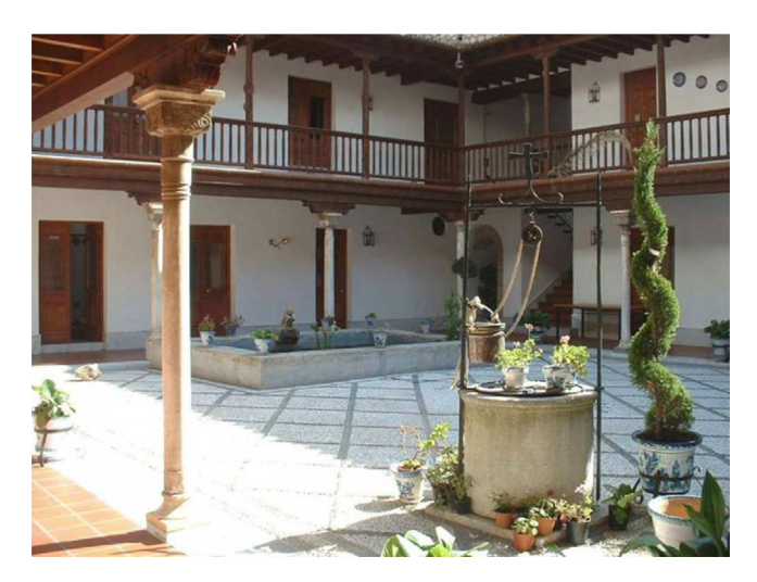
Figure 1 The patio of the Tinea Hospital, as it appears today.

A plaque at the end of the hallway that gives access to the old hospital summarizes the founder's ideas about caring for the poor and infirm as a work of compassion. The views expressed were undoubtedly the sentiments that gave rise to the decision to establish the hospital: