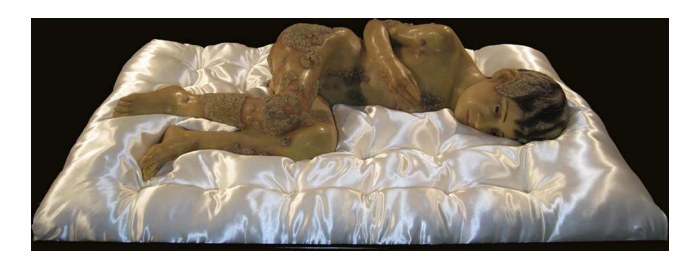
Figure 1 The figure known as the boy with generalized favus.

Of all these legends and tales, one in particular caught our attention, that of the boy—or girl—with generalized favus. This patient is the subject of one of the museum's most emblematic wax models. Restored in 2009, this complete figure (Fig. 1) had been found when a group of boxes were opened in 2005. The box was in good condition and the figure was intact inside a glass case, although some of the colors had faded. There was also a label (Fig. 2) naming the sculptor (Zofío) but giving no further information that could be used to date the work.