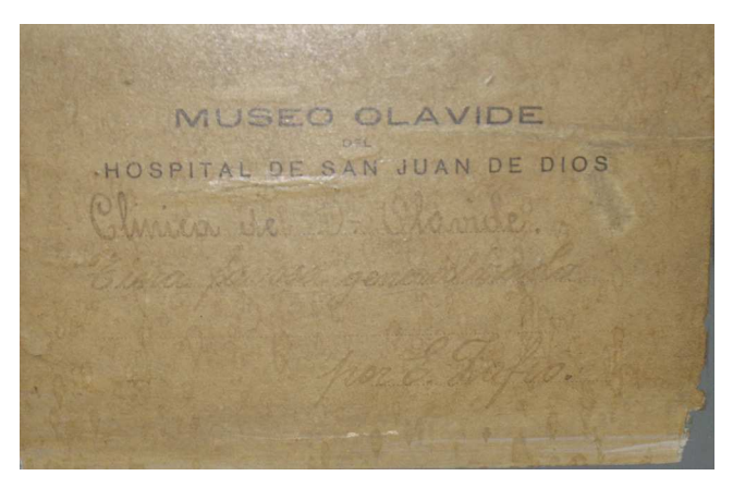
Figure 2 Label found with the figure.

Around 40 years ago, a 12-year-old boy was admitted to Hospital San Juan de Dios with generalized favus, in a condition that left him truly monstrous. He stayed in the hospital several months and, as his