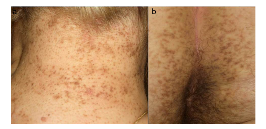
Figure 1 Small brownish macules with a tendency to coalesce in a reticular pattern. A, In the posterior cervical region. B, In the intergluteal fold.

DDD has been associated with certain skin diseases, in particular multiple keratoacanthomas,<sup>5</sup> epidermoid cysts,<sup>5</sup> and squamous cell carcinoma.<sup>6</sup> An important association is with HS, as found in our patient, though few cases have been reported in the literature.<sup>1,2,5,7-9</sup> HS is a multifactorial disease that most commonly affects young people