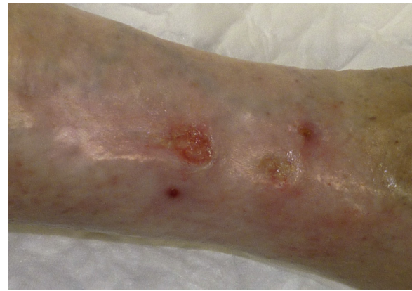
Figure 2 Leg ulcer region after 27 shock wave therapy sessions comprises a proximal ulcer measuring 1.2 × 0.9 cm and a distal ulcer measuring 0.8 × 0.8 cm.

Dystrophic calcification is the term used for the formation of insoluble calcified deposits in the skin and soft tissues (calcinosis cutis) owing to tissue damage in individuals with normal calcium and phosphorus serum levels. 1 It is frequently, but not exclusively, associated with autoimmune diseases of connective tissue, particularly dermatomyositis