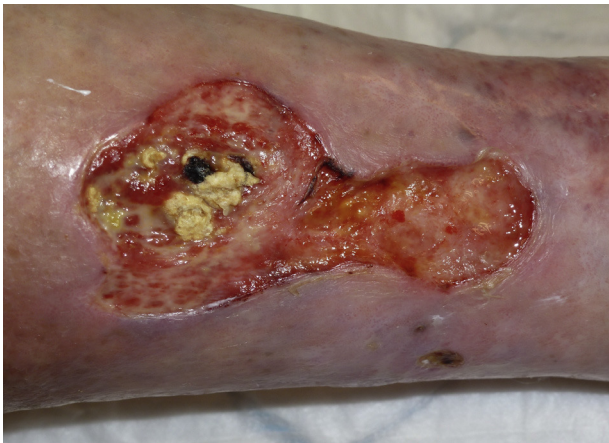
Figure 1 Right supramalleolar ulcer with extrusion of calcified material, prior to shock wave therapy. Largest diameter was 8 cm, proximal width was 4.5 cm, and distal width was 2.5 cm.

the malleoli of her right leg. The lesions were very painful and frequently infected. Results of another biopsy, performed in 2009, were consistent with calcified scleroderma. The patient's calcium-phosphorus product was normal, and a radiograph of her leg revealed subcutaneous calcification. All these findings were consistent with dystrophic calcification. We initially treated the patient with oral corticosteroids, with courses of antibiotics added whenever infection occurred.