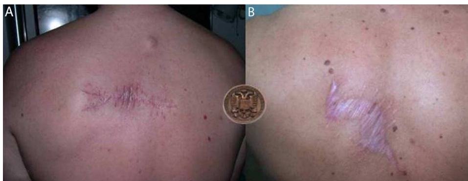
Figure 1 A, Suture marks in the borders of a scar. B, In the long term, these marks are often associated with dehiscence.

In 1992, Weber and Wulc 1 described the vector-running suture for the closure of wounds situated in areas of tension