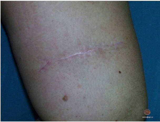
Figure 3 Scar from the excision of a melanoma on the anterior aspect of the right thigh 2 years after performing the vector-running subcutaneous suture. The same case is presented in the video.