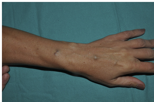
Figure 2 Bluish nodule on the mother's right forearm.