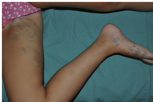
Figure 1 Segmentally distributed bluish plaque extending from the right groin along the medial aspect of the right thigh and leg to the right foot.

Glomangioma, or glomuvenous malformation, is a hamartoma of the dermal glomus bodies, which are responsible for temperature regulation. The 2 clinical forms described are solitary glomus tumor and glomuvenous malformations, or multiple glomangiomas. The first presentation is the more common and manifests typically in adults as painful isolated bluish nodules at acral sites. Glomuvenous malformations, or multiple glomangiomas, are characterized by the pro-