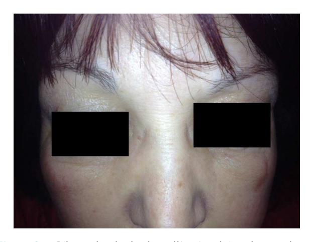
Figure 2 Bilateral palpebral swelling involving the nasal root 72 hours after onset.