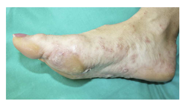
Figure 1 Palmoplantar vesicles of 24 hours duration.

A 56-year-old woman presented at the emergency room with palmoplantar blisters and vesicles (Fig. 1) that were very painful and itchy and had appeared 24 hours previously. She was diagnosed with dyshidrosis. Several days later she developed blisters on the trunk and extremities, without mucosal involvement. A biopsy of one of the lesions was performed. Three weeks previously the patient had been treated for a urinary tract infection with oral fosfomycin, and had experienced diarrhea secondary to the antibiotic treatment. Laboratory tests, including indirect immunofluorescence analysis of antinuclear, antitransglutaminase, anti-intercellular adhesion, and anti-basement membrane antibodies, were normal. Histopathology revealed subepidermal blisters that contained a papillary dermal infiltrate consisting of abundant neutrophils and formed noneosinophilic microabscesses at the tips of the papillary ridges. Direct immunofluorescence (DIF) revealed linear