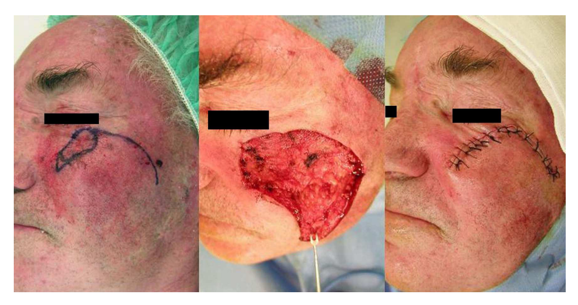
Figure 3 Advancement-rotation flap.

inferior part of the defect was triangulated and a semicircle of healthy skin was excised along the superolateral border to facilitate positioning of the flap. The borders of the flap were sutured with 4/0 silk (Fig. 3).