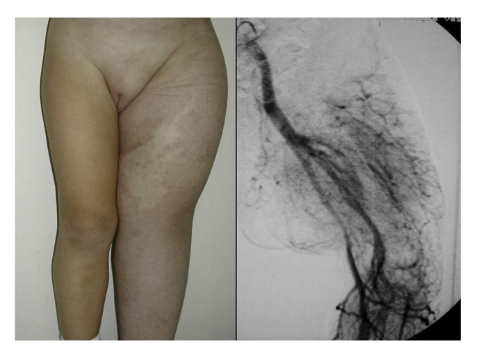
Figure 8 Parkes-Weber syndrome: generalized hypertrophy of a limb associated with an arteriovenous malformation.

Embolization is performed 24 to 72 hours prior to surgery in order to reduce blood loss. However, some interventional radiologists perform percutaneous transarterial and transvenous embolization simultaneously, as the only treatment, achieving results similar to surgery, particularly in complex sites such as the head and neck<sup>44</sup>; however, this usually requires several interventions. In contrast, embolization via a single access route in the hands of an inexperienced radi-