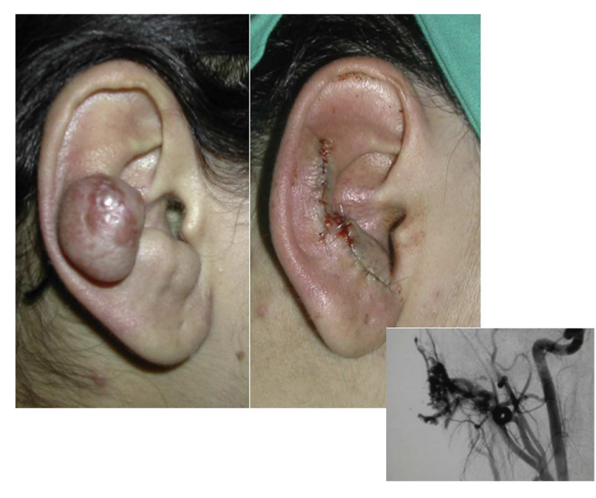
Figure 7 Ateriovenous malformation. Surgical treatment.

Surgical excision with free margins is extremely difficult when the AVM is situated in a critical area, such as the face, or in the case of diffuse, poorly delimited lesions or ones that invade neighboring structures. In these cases, the best option, when feasible, is observation; surgical excision would probably be incomplete and there is a risk of recurrence or exacerbation. Should surgery be performed, the primary objectives are symptom relief, the preservation of vital functions, and improvement of deformities. Thanks to the advances in endovascular techniques and the materials now available, surgery can be less aggressive. Furthermore, it should not be forgotten that when an intervention is performed late, it will be more complex and will be less likely to be curative.