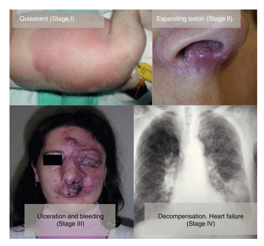
Figure 4 Schöbinger stages.

Progression of the lesions is evident as an increase in the communication, giving rise to arterial steal and venous