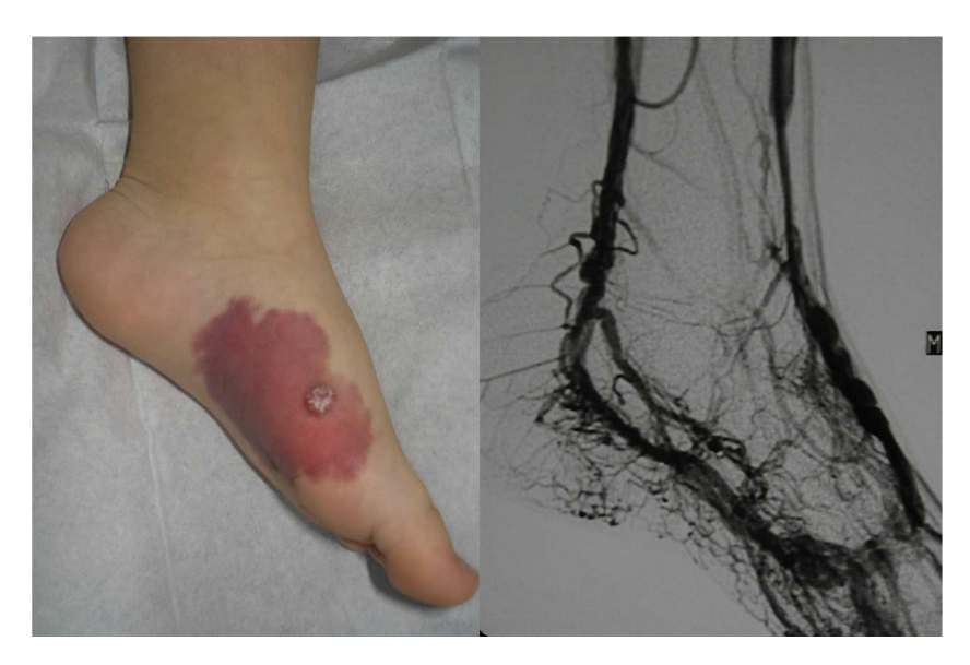
Figure 5 Nodular lesion of recent appearance on a capillary malformation. Arteriovenous malformation.

The clinical manifestations and even the usual diagnostic tests cannot differentiate between the 2 entities at such an early age; it is the clinical course of the lesions that gives us the definitive diagnosis in the majority of cases. This difficulty should soon be resolved thanks to the latest advances