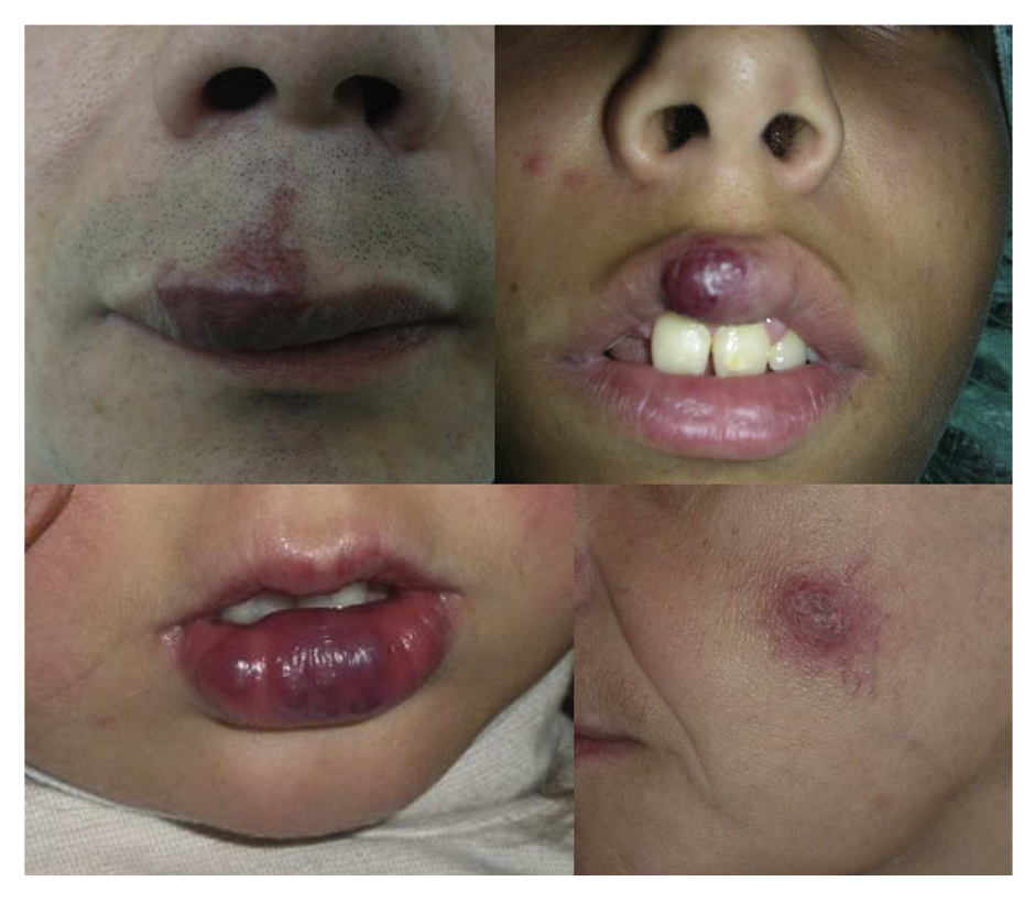
Figure 1 Ateriovenous malformations. Lesions can progress rapidly at birth or appear later.