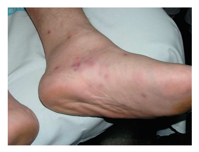
Figure 1 Case 2. Detail of erythematous papules.

Patient 2 was a 37-year-old man with human immunodeficiency virus (HIV) infection, type 2 diabetes mellitus, and Burkitt lymphoma in complete remission (nonrecent chemotherapy). He had multiple crops of papules on the legs and soles of the feet (Fig. 1), histopathological findings consistent with NEH, and a positive lesion culture for Mycobacterium chelonae . The recurrent skin lesions