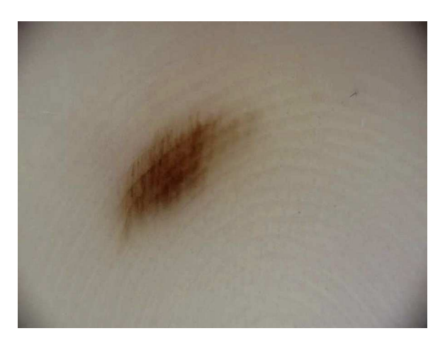
Figure 6 Fibrillar pattern in a melanocytic nevus on the right heel of a 31-year-old man.

On the soles, 28 nevi (17.7%) were located on the arch, 20 (12.7%) on the external aspect of the sole, 16 (10.1%) on the volar aspect of the digits, 8 (5.1%) on the heels, and 5 (3.2%) in the metatarsal sole area. The parallel furrow pattern was also the most common pattern in all locations (n = 36, 46.7%) except the heel, where it was the fibrillar pattern. Table 1 summarizes the distribution of dermoscopic patterns according to the anatomical site of the lesion.