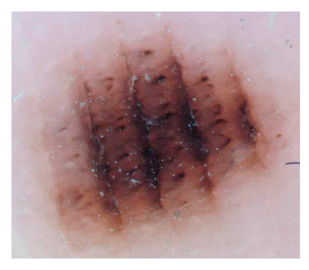
Figure 2 Parallel furrow pattern with globules in the ridges in a melanocytic nevus located on the arch of the right sole of a 33-year-old man.

In total, 158 acral volar nevi from 80 patients were analyzed. The mean number of nevi per patient was 2 (1.3) and the mean diameter of lesions was 2.5 (1.7) mm. According to the 3-step algorithm for the management of acquired acral melanocytic lesions, ^2 3 lesions measuring 8 and 9 mm in diameter were biopsied in 3 patients. They corresponded to acquired acral melanocytic nevi on the sole. The rest of the lesions will be monitored as necessary. The most prevalent dermoscopic pattern was the parallel furrow pattern, observed in 81 nevi (51.3%) (Figs. 1–4). This was followed by the latticelike pattern (n=21, 13.3%) (Fig. 5), the homogeneous pattern (n=20, 12.7%), the globular pattern (n=15,