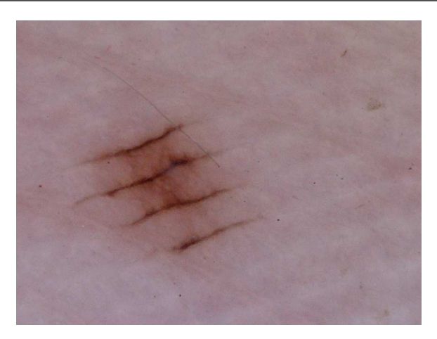
Figure 1 Parallel furrow pattern in a melanocytic nevus located on the thenar eminence of the right palm of a 36-year-old woman.

digits, external aspect of the sole, and the metatarsal sole area.