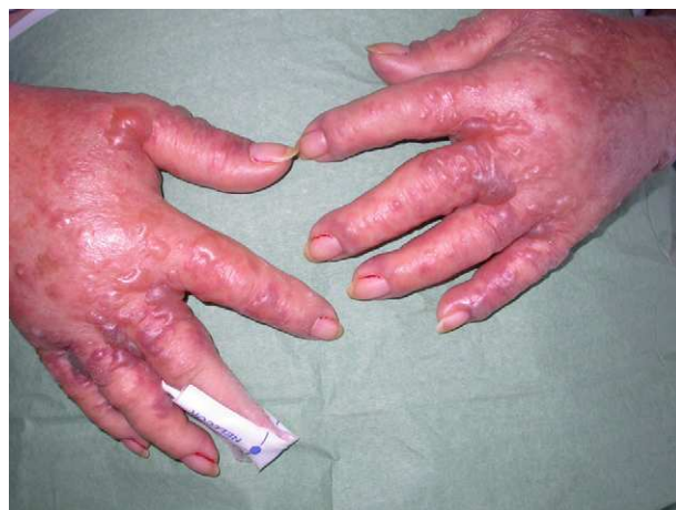
Figure 2 Tense blisters filled with clear fluid on the dorsum of the hands.

The patient was a 60-year-old woman with a history of rheumatoid arthritis, systemic hypertension, and dyslipidemia, who was receiving treatment with deflazacort (18 mg/d), diclofenac (50 mg/d), omeprazole (20 mg/d), and a combination of hydrochlorothiazide and valsartan (150/12.5 mg). She was prescribed treatment with sulfasalazine (2 g/d) for joint pain. Three weeks later the patient presented to the emergency department with fever and skin lesions on the trunk and limbs that had appeared 2 weeks previously. Physical examination revealed general malaise, fever, hypotension, and tachycardia. Confluent erythematous macules and papules that formed moderately infiltrated plaques with poorly defined borders affected 70% of the body surface area. Tense blisters filled with a clear fluid were present on both legs and the dorsum of the hands (Figures 1 and 2), but the Nikolsky sign was negative. No mucosal lesions or lymphadenopathy were detected. Blood tests revealed a white blood cell count of 15 700/ \mu L (normal range, 4500-11 000/ \mu L) (54.5% neutrophils [normal range, 40.0%-70.0%] and 8.4% eosinophils [normal range, 0.00%-5.00%]) and eosinophilia of 1320/ \mu L; erythrocyte