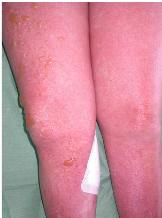
Figure 1 Erythematous papules coalesced to form firm plaques on the lower limbs, accompanied by blisters filled with clear fluid.

sedimentation rate, 42 mm/h; alanine aminotransferase, 44.5 U/L (normal range, 7-40 U/L); \gamma -glutamyltransferase, 452.3 U/L (normal range, 12-54 U/L); lactate dehydrogenase, 716.1 U/L (normal range, 230-460 U/L); and C-reactive protein, 9.88 mg/dl. Serology for Epstein-Barr virus (EBV) was positive (IgM and IgG) and abdominal ultrasound showed no abnormal findings. Skin biopsy revealed a blister caused by dermoepidermal detachment with a neutrophil-rich infiltrate (Fig. 3) and on direct immunofluorescence there were