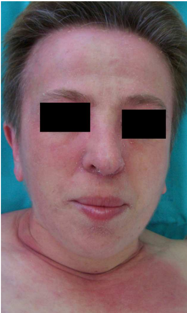
Figure 2 Dermatomyositis and breast cancer (facial erythema).

in women 17 and lung and prostate cancer in men, although gastrointestinal and ureteral tumors, 18 and nasopharyngeal carcinomas 19 are also seen. Raynaud phenomenon is not common in paraneoplastic dermatomyositis. Because