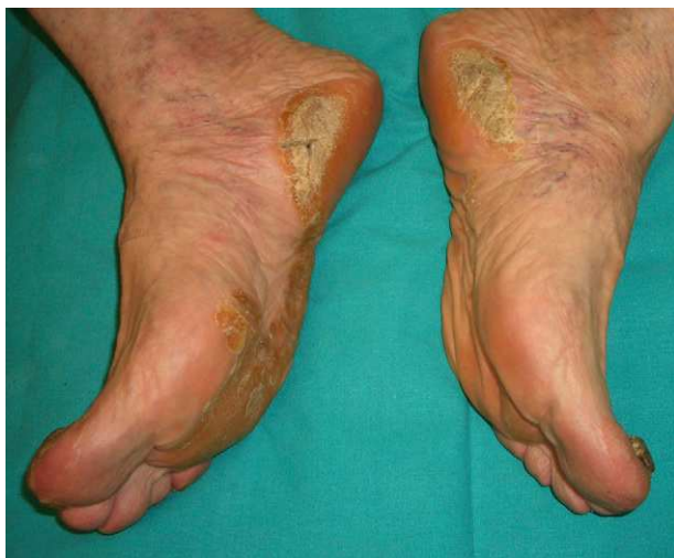
Figure 8 Paraneoplastic acrokeratosis of Bazex (plantar hyperkeratosis and nail dystrophy).

Psoriasis must be considered in the differential diagnosis; the lesions have a psoriasiform appearance, but they are poorly circumscribed and have a fine pityriasisform scale and a blue color; vesicles and blisters may also develop. Palmoplantar hyperkeratosis is more common at the pressure points of the palm and does not affect the central area.