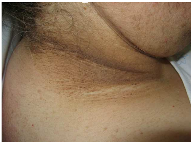
Figure 4 Acanthosis nigricans (hyperpigmentation on the neck).

Ectopic ACTH syndrome (**) is a feature of Cushing syndrome caused by the secretion of ACTH by pituitary or ectopic tumors. The hyperpigmentation in such cases is diffuse, similar to that seen in Addison disease, and more intense in exposed areas (face, neck, back of hands), areas affected by trauma or subject to slight pressure, and mucous membranes. The cause is unclear, but the pigmentary changes have been linked to the production of the polypeptide \beta -lipotropin, which is capable of inducing the production of MSHs, which in turn, stimulate the production of melanocytes in the skin.