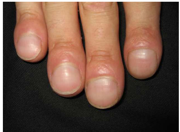
Figure 14 Digital clubbing in pachydermoperiostosis.

Vascular skin manifestations in patients with underlying malignancies are quite nonspecific. 5 They are many and diverse, and include telangiectasia, purpura, ischemic lesions, vasculitis, thrombophlebitis, livedo reticularis, and palmar erythema (Table 8). Collateral circulation, which is