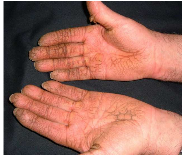
Figure 9 Palmar keratoderma.

The lesions can precede the detection of the underlying malignancy by a year; commonly associated malignancies are squamous cell carcinomas of the larynx, esophagus, and lung, 48,49 but some cases have been reported in other malignancies, including ductal breast adenocarcinoma, cholangiocarcinoma, adenocarcinoma of the colon and prostate, 50 lymph node metastasis in the neck, and liposarcoma. 51