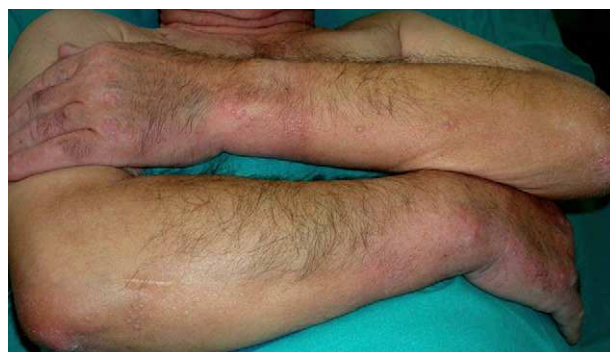
Figure 11 Scleromyxedema (waxy papules on the upper extremities).

clusters of linear, symmetrically distributed lesions on the hands, the elbows, the forearms, the trunk, the face, and the neck (Figs. 11 and 12). The papules coalesce, giving the skin a thick, scleroderma-like appearance and resulting in decreased joint motility. The furrowing of the skin