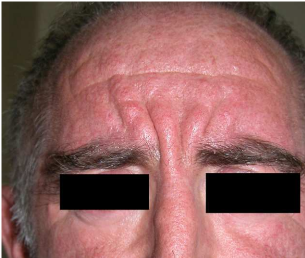
Figure 15 Pachydermoperiostosis (facial thickening).

sometimes very evident, has already been discussed in the section on superior vena cava syndrome.