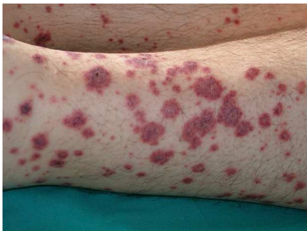
Figure 17 Leukocytoclastic vasculitis (palpable purpura).

tological malignancy, while the remaining 20% or so have a solid tumor or a tumor of unknown origin. Some tumors are more common in patients with certain subtypes of vasculitis. For example, solid tumors are more frequently associated with Henoch-Schönlein purpura temporal arteritis, while lymphoma and leukemia are more frequently associated with leukocytoclastic cutaneous vasculitis and polyarteritis nodosa. The clinical presentation is heterogeneous, with palpable purpura, papules, nodules, urticaria, necrosis, and ulceration (Fig. 17). 2,5