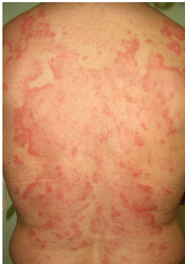
Figure 7 Subacute cutaneous lupus erythematosus (annular lesions on the back).

The association between acute cutaneous lupus erythematosus (***) (Fig. 7) and systemic malignancy was first described in 1980, and in total, approximately 14 cases have been described in association with lymphoma and cancer of the lung, breast, stomach, uterus, liver, and larynx. The lesions predate the diagnosis of the underlying tumor by between a month and 3 years. Despite these reports, however, doubts still remain about the paraneoplastic nature of granuloma annulare; the possibility of an underlying