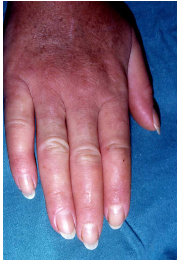
Figure 13 Systemic scleroderma in lymphoma (scleroderma-like hands).

There is a primary and secondary form of the disease. The former is usually hereditary and progresses slowly, while the latter—the paraneoplastic form—is associated with cardiopulmonary disorders. In 80% of cases, the paraneoplastic presentation is associated with lung cancer, metastases to the lung, nasopharyngeal carcinoma, and other less common cancers. 19,25,29,66,67