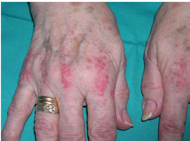
Figure 3 Dermatomyositis (Gottron papules).

in women 17 and lung and prostate cancer in men, although gastrointestinal and ureteral tumors, 18 and nasopharyngeal carcinomas 19 are also seen. Raynaud phenomenon is not common in paraneoplastic dermatomyositis. Because