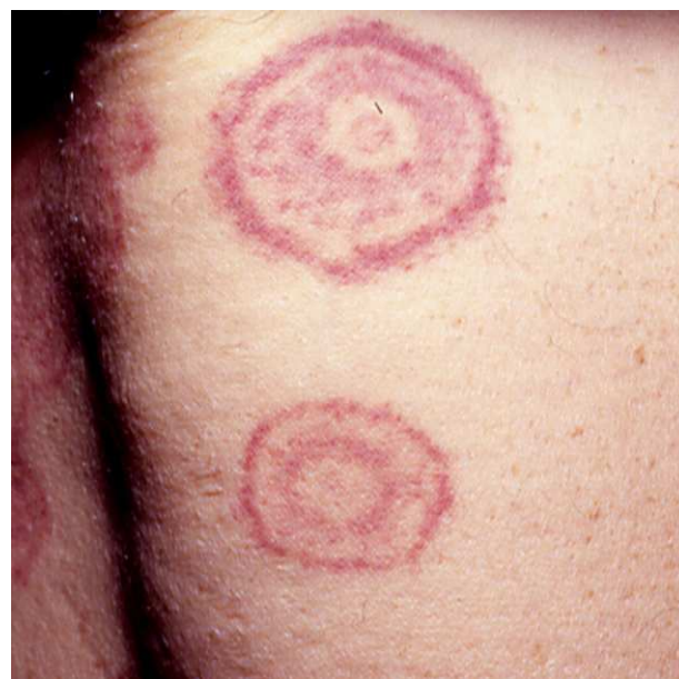
Figure 5 Erythema gyratum repens (concentric rings).

Histologic features include moderate spongiosis, parakeratosis, and a perivascular lymphohistiocytic infiltrate. As also occurs with pemphigus, deposits of immunoglobulin G and/or C3 may be seen in the basal membrane.