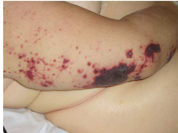
Figure 16 Purpura and ecchymosis.