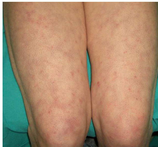
Figure 18 Livedo reticularis.

Venous thrombophlebitis in isolation is rarely a sign of malignancy. However, spontaneous, recurrent, multiple, superficial, or migratory thrombophlebitis (Trousseau syndrome) is paraneoplastic in 50% of lymphomas, leukemias, and cancers of the pancreas, lung, prostate, stomach, and colon. The appearance of this sign is related to a generalized hypercoagulable state.