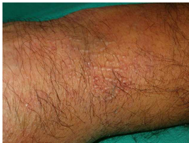
Figure 12 Detail of papules in patient with scleromyxedema from Figure 11.

clusters of linear, symmetrically distributed lesions on the hands, the elbows, the forearms, the trunk, the face, and the neck (Figs. 11 and 12). The papules coalesce, giving the skin a thick, scleroderma-like appearance and resulting in decreased joint motility. The furrowing of the skin