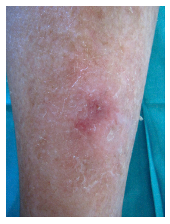
Figure 3 Mild erythema and desquamation 3 months after the photodynamic therapy session.

presented with this dermatosis and to know the different therapeutic options available.