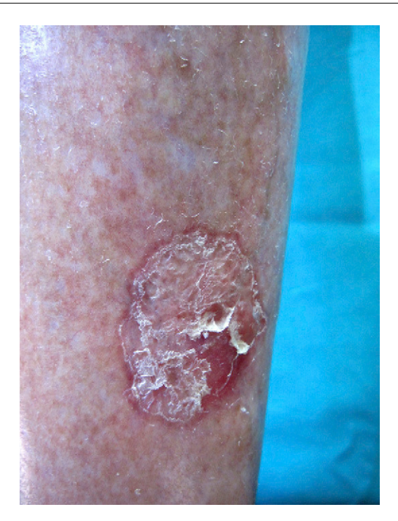
Figure 1 Erythematous plaque measuring 4 \times 3 cm, covered with a thick, whitish scale.

or immunocompromised patients have the greatest risk of malignant transformation.<sup>2</sup> Reported neoplasms, in order of frequency, are Bowen disease, epidermoid carcinoma, and basal cell carcinoma.<sup>1,2</sup> Because of the risk of malignancy, it is important to consider the best approach to take when