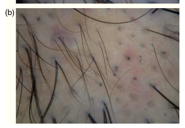
Figure 2 (a) Dermoscopy showing yellow dots, empty follicular openings, black dots and cadaverized hairs, very similar to AA. Exclamation mark hairs were absent. (Dermoscopy, at 40 \times magnification.) (b) Dermoscopy of follow-up, showing short regrowing hairs and dystrophic hairs. (Dermoscopy, at 70 \times magnification.)