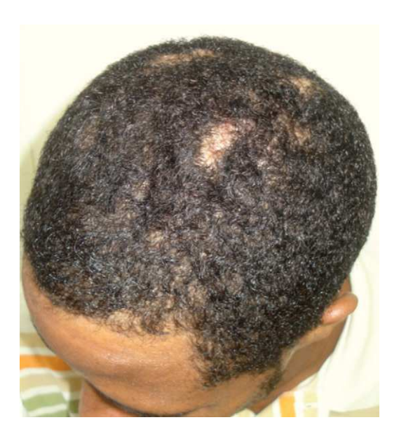
Figure 1 Alopecic patches with discrete nodules of DCS, resembling AA.

Dissecting cellulitis of the scalp (DCS) is a follicular occlusion disorder that may progressively lead to scarring alopecia. It presents as multifocal painful nodules and boggy plaques with alopecia which is reversible in early disease, but can become scarring in longstanding lesions.<sup>1</sup> Dermoscopy is an useful non-invasive method for diagnosis and management of hair and scalp disorders, including cicatricial alopecia, such as lichen planopilaris, lupus erythematosus, and folliculitis decalvans.<sup>2-5</sup>