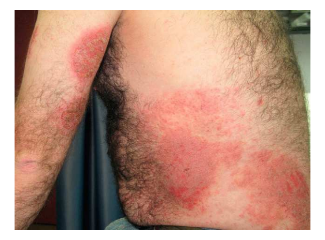
Figure 1 Eczematous plaques on the trunk and arms.

which he controlled the residual dermatitis with topical corticosteroids. However, in the last year the patient had begun to have flare-ups of disseminated, intensely pruritic, exudative eczematous lesions affecting the trunk, face, arms, legs, and palms (Fig. 1). As treatment with oral prednisone (1 mg/kg) produced only a transient response, oral cyclosporin was again prescribed at a dosage of 5 mg/kg but almost no response was achieved. Given the change in morphology of the lesions and the absence of a satisfactory response, the patch tests were repeated with the GEIDAC standard series, a cosmetics series (Chemotechnique), and various products used by the patient, including hygiene and hydration products and several topical corticosteroids (Clovate cream, Fucibet cream, Adventan cream and Decloban ointment). The readings at 48 and 96 hours were positive (++) for 1% chlorocresol in petrolatum, Clovate cream, and Fucibet cream. It was found that chlorocresol was included in the formulation of these corticosteroids and a subsequent patch test with a corticosteroid series (Martí Tor) showed no additional sensitization. After avoiding this allergen, the patient improved and is currently controlled with clobetasol propionate ointment (Decloban) without adverse effects.