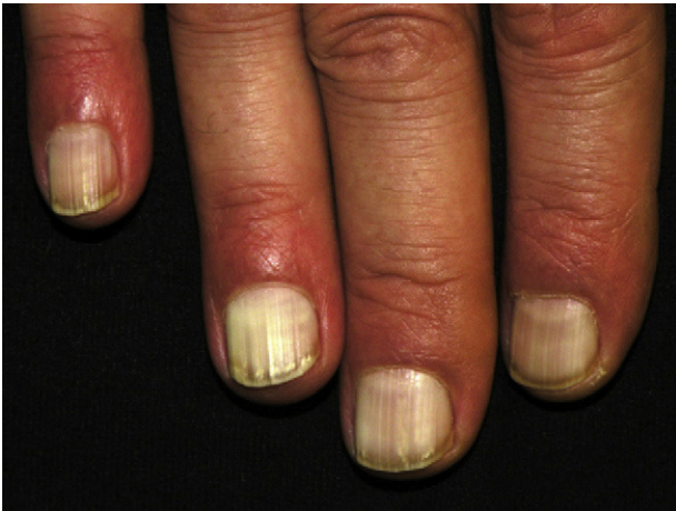
Figure 2 Detail showing true leukonychia at closer range.

be idiopathic or secondary to injury to the nail matrix, exposure to chemotherapeutic agents or other drugs, or underlying systemic diseases 5 (measles, acute myocardial infarction, pellagra, or Hodgkin lymphoma). Pseudoleukonychia has been seen in cases of liver cirrhosis (Terry nails), hypoalbuminemia (Muehrcke lines), zinc deficiency, renal failure (half-and-half nails), and Kawasaki disease. The pathophysiologic mechanism of true leukonychia is not fully understood, although it is believed to be secondary to abnormal keratinization of the nail plate. The term pseudoleukonychia refers to an alteration of the nail plate caused by the action of an external agent. 5