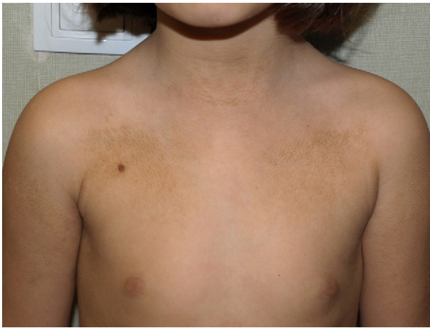
Figure 1 Clinical appearance of the lesions.