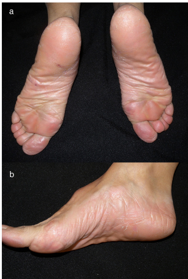
Figure 2 Complete resolution after 4 weeks of treatment with alitretinoin.

lesions occurred in up to a third of patients who initially responded to alitretinoin after 24 weeks of follow-up. A recent study reported that a second course of treatment with alitretinoin at a dosage of 30 mg/d in patients who relapsed achieved clearance in up to 80% of cases, with good tolerance 6 ; this would indicate that this medication could be used for long-term management of chronic hand eczema. Alitretinoin is therefore a useful and probably cost-effective treatment for this condition. 7