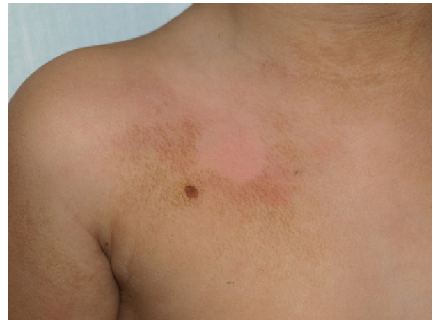
Figure 3 Clinical appearance of the lesions after swabbing with a cotton ball soaked in 70% ethyl alcohol.

Terra firma-forme dermatosis is much more common than the literature would lead one to believe. It was first described by Duncan et al., 1 who reported cases from the 1970s and gave the condition its Latin name for its earthy or dirtlike appearance. The cause of terra firma-forme dermatosis is not yet fully understood. It is believed that the lesions arise as a consequence of a delay in the maturation of keratinocytes, with melanin retention, and a sustained accumulation of sebum, sweat, corneocytes, and microorganisms in regions in which hygiene measures are less rigorous (e.g. neck, trunk, navel, and flanks), leading to insufficient exfoliation and the formation of a highly adhesive, compact dirt