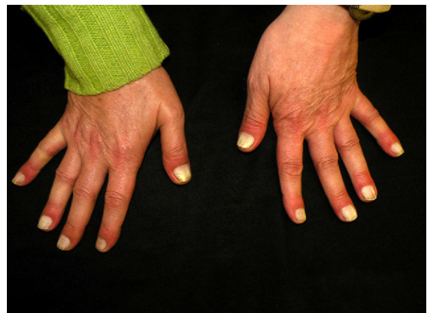
Figure 1 Complete whitening of all 10 nail plates on the hands.

Leukonychia is defined as a whitening of the nails. It was first described in 1919 by Mees, 2 who found an association between this alteration of a skin appendage and arsenic poisoning. When nail plate involvement begins at the nail matrix, the condition is considered to be true leukonychia, which can be hereditary or acquired. Hereditary true leukonychia may occasionally be seen in the context of rare, complex syndromes such as LEOPARD syndrome, Bauer syndrome, and keratoderma hypotrichosis leukonychia syndrome. 3,4 Acquired true leukonychia can