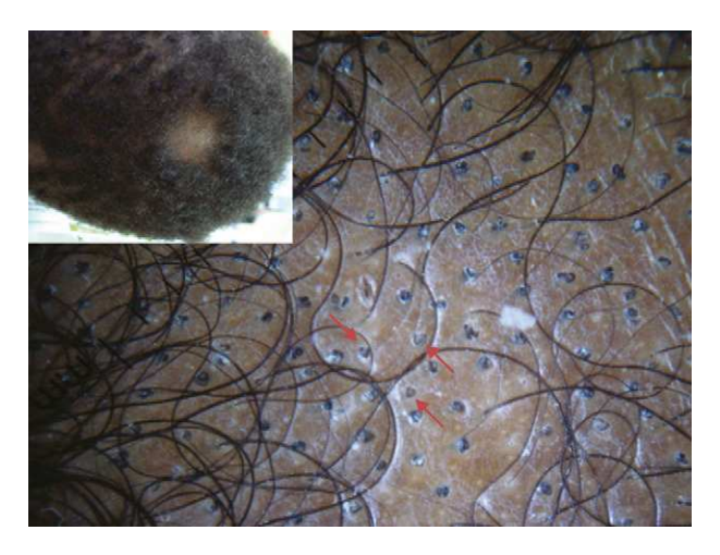
Figure 2 Several plaques of alopecia in the parieto-occipital region. Numerous comma hairs (arrows) are seen in the dermoscopic image (handheld Dermlite II Pro dermatoscope and Sony DSC-W55 camera, original magnification \times 20 ).