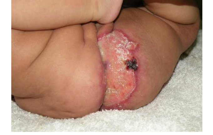
Figure 1 Ulcer with erythematous-violaceous borders and a shiny base in the left perianal region.