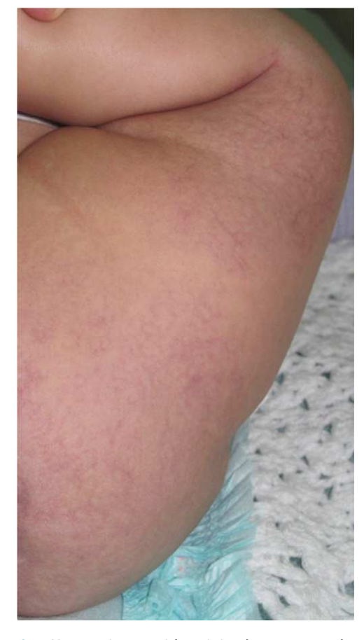
Figure 2 Hemangioma with minimal or arrested growth. There is a pale, erythematous macule with multiple fine telangiectasias.