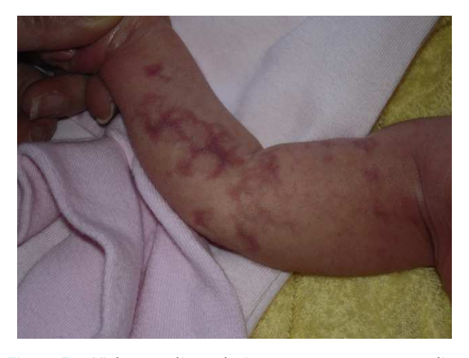
Figure 5 Violaceous linear lesions on an arm corresponding to localized cutis marmorata telangiectatica congenita.

Cutis marmorata telangiectatica congenita is a rare, sporadic congenital vascular malformation first described by Van Louizen in 1922. It presents as localized or generalized erythematous-telangiectatic lesions with a reticular pattern; the lesions are almost always present at birth or develop in the first days of life<sup>32</sup> (Fig. 5). In the largest series published to date, consisting of 85 patients, 60% of patients had localized lesions and 65% had unilateral lesions, mostly affecting the lower limbs.<sup>33</sup> Twenty percent of patients with cutis marmorata telangiectatica congenita have capillary malformations in other locations, including port-wine stains, nevus anemicus, and angiokeratomas<sup>34</sup>; there has even been a report of cutis marmorata telangiectatica congenita initially manifesting as a port-wine stain.<sup>35</sup> The lower limbs