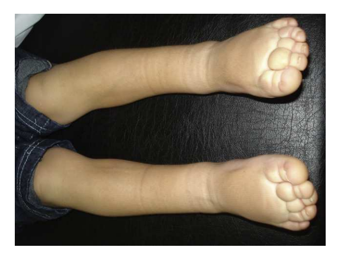
Figure 13 Primary lymphedema on the lower limbs (Milroy disease).