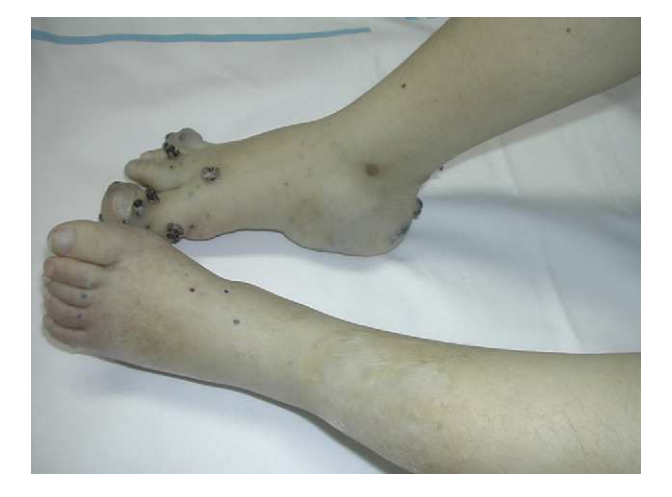
Figure 11 Multiple venous lesions should raise suspicion of blue rubber bleb nevus syndrome (Bean syndrome), which is characterized by the association of multiple visceral lesions, mostly affecting the digestive system.

large solitary masses, frequently located at the cephalic pole, are occasionally seen at birth; and 2) they occur in association with visceral lesions that affect the gastrointestinal system in particular. Patients thus often have gross or occult blood in the stools and iron deficiency anemia<sup>71</sup> (Fig. 11). There may also be neurologic symptoms,<sup>72</sup> sometimes as a primary manifestation. The syndrome has also been associated with multiple intracranial vascular malformations, developmental venous anomalies in the brain, and sinus pericranii.<sup>73</sup>