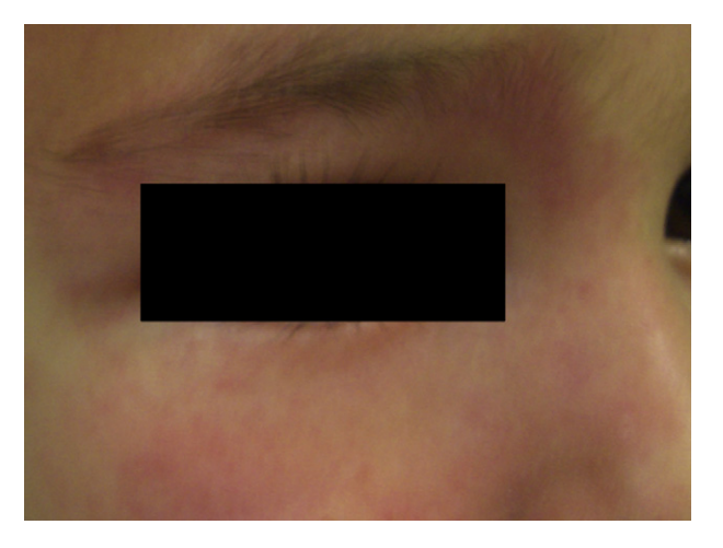
Figure 4 Pinkish erythematous lesion on the face corresponding to a nevus roseus; the color is slightly paler than that of a port-wine stain, but the 2 lesions can sometimes be impossible to distinguish.

The fact that nevus roseus occurs in association with phacomatosis pigmentovascularis type III (phacomatosis spilorosea) is the strongest evidence that it is a separate entity.