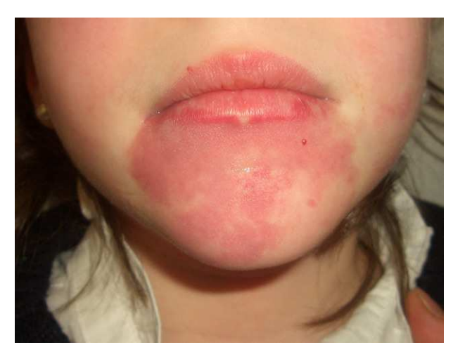
Figure 2 Capillary malformation (port-wine stain) on the chin.

Port-wine stains generally become deeper, thicker, and darker in color over time, mainly as a result of progressive vascular dilatation. As a result of these changes, which are generally much more evident on the face, patients often develop hypertrophy and nodularity after the third or fourth decade of life. The fact that nodules are only found on the face and do not occur in childhood has led some authors to suggest that port-wine stains might actually be hamartomatous lesions.<sup>8</sup>