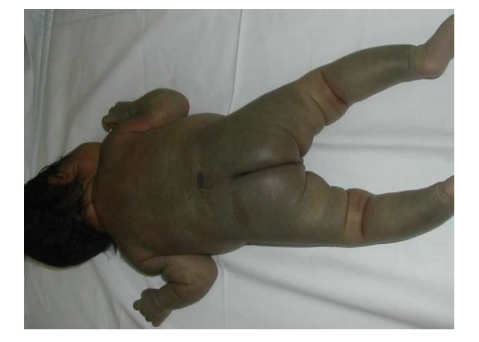
Figure 6 Large Mongolian spot in association with a capillary malformation on the upper back. Happle's phacomatosis cesioflammea.

Table 4 Classification of Phacomatosis Pigmentovascularis.