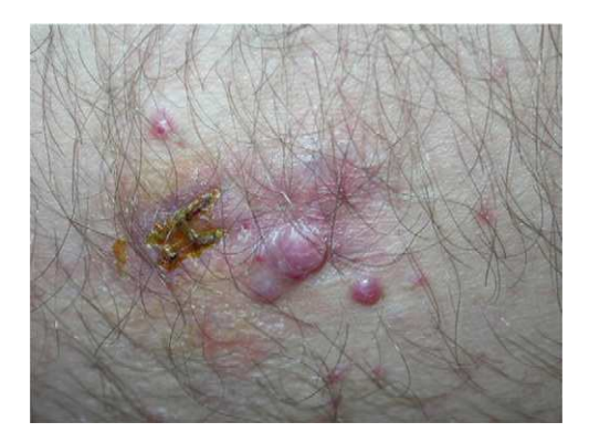
Figure 1 Pyogenic granulomas of different sizes, 1 biopsied, around the scar from the primary lesion on the thigh.

and 2 males (Table 1) aged 4 to 31 years (mean, 13 y). The lesions were located on the trunk or thighs and appeared after the initial treatment for pyogenic granuloma by surgical excision or electrodessication (Figs. 1 and 2). The time from initial treatment to the appearance of RPG ranged from 1 to 9 months (mean, 3 mo). In all cases the RPG lesions disappeared spontaneously, beginning to regress after 45 to 120 days (mean, 81 d).