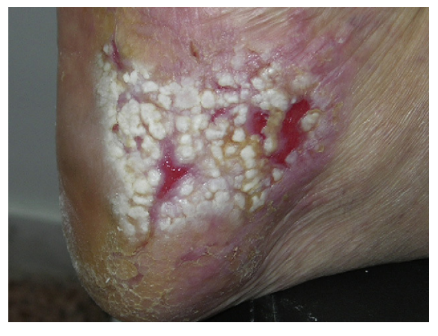
Figure 2 Ulcerated plaque, located on the right heel, filled with granulation tissue and whitish, macerated epithelium in some areas.

a 1-month regimen of topical clobetasol propionate (500 mcg/g). She has remained asymptomatic since treatment was completed 24 months ago.