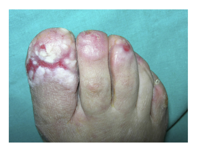
Figure 1 Absence of 5 toenails and ulcer on the dorsal aspect of the first toe similar to the ulcers on the heel.

On the basis of the clinical and histopathologic findings, the patient was diagnosed with erosive palmoplantar LP and was prescribed treatment with oral prednisone (1 mg/kg/d). Two months later, the ulcerated lesions had healed. Systemic treatment was continued with a tapering dose for a further 6 months and finally withdrawn. The patient then started