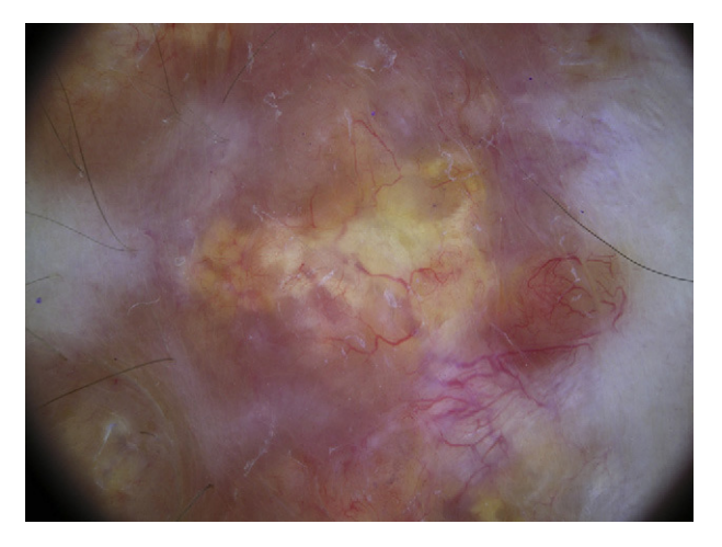
Figure 2 Dermoscopic image with yellow homogeneous areas surrounded by large telangiectatic vessels on a red-orange background (Fig. 2).

The lesion we describe was large, morphologically irregular, with dermoscopic features similar to those described for juvenile xanthogranuloma or solitary reticulohistiocytoma, although our lesion had a wider range of coloration, with a milky-red central zone, multiple yellow clouds surrounded by arborizing vessels, and an erythematous-orange peripheral area.