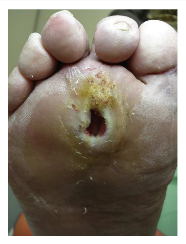
Figure 2 Ulcer in a diabetic foot. The area under the metatarsal heads is the most common location for ulcers in the feet of patients with diabetes.

foot care and the elimination of calluses have been shown to reduce plantar pressure and the risk of ulcer formation.<sup>32</sup>