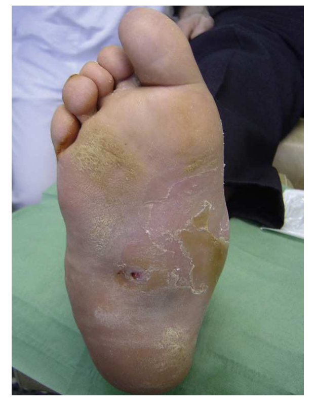
Figure 5 Plantar ulcer in a foot with Charcot arthropathy. The loss of the medial concavity of the foot shown here is characteristic of the advanced stages of Charcot arthropathy.