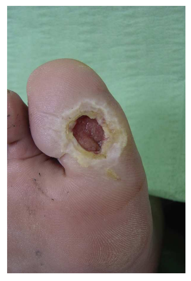
Figure 3 Ulcer in a diabetic foot. The hyperkeratotic skin surrounding the ulcer suggests it developed on a callus.

The Wagner system, which classifies an ulcer according to its depth and the extent of gangrene, is perhaps the most widely used.<sup>33</sup> The University of Texas classification system takes into account the depth of the ulcer, as well as the presence or absence of infection and ischemia, but does not assess the diameter of the lesion or the presence of neuropathy.<sup>34,35</sup> The details of these 2 classification systems are shown in Table 1. The classification system known as SAD considers 5 different aspects of each lesion encompassing size (depth and area), sepsis (presence or absence), arteriopathy, and neuropathy.<sup>36</sup> These same aspects are evaluated in the PEDIS system proposed by the international Working Group of the Diabetic Foot.<sup>37</sup>