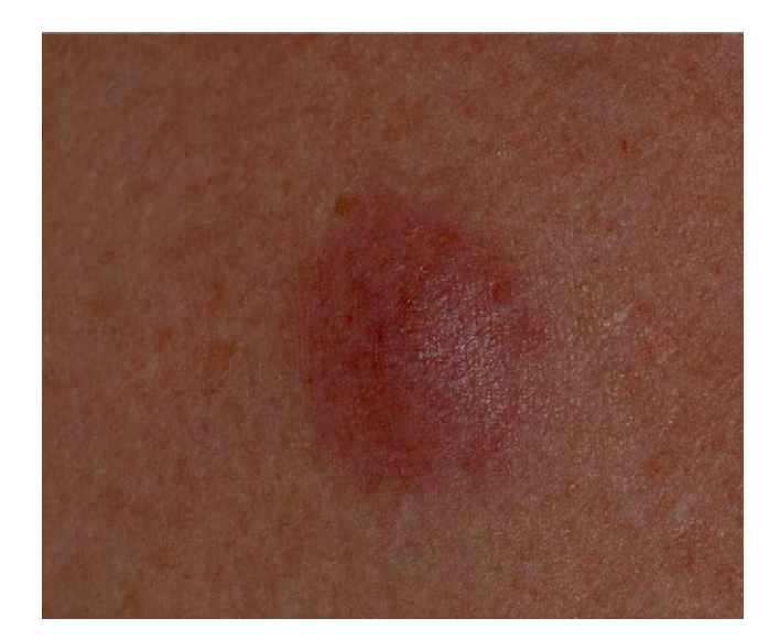
Figure 1 Nodule on the chest.

asymptomatic subcutaneous nodular lesions on the face, chest and back. The nodules had an erythematous-violacious appearance, were slightly raised, and had diameters ranging between 8 mm and 20 mm (Fig. 1). Biopsy of the lesions showed a lymphoid infiltrate composed of small monomorphous cells, compatible with FL infiltration (CD20<sup>+</sup>, Bcl2<sup>+</sup>, Bcl6<sup>+</sup>) (Fig. 2). Reassessment of the disease at this time