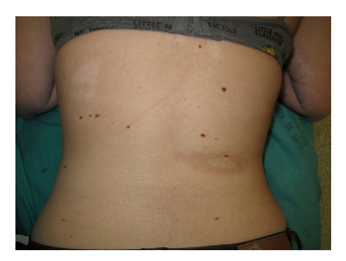
Figure 1 Vitiligo lesions and morphea-like plaque on the back.

Therefore, the association between vitiligo and interferon remains unclear. Some authors claim that it indicates a favorable prognosis, whereas others reject this theory. What does seem to be true is that patients who present