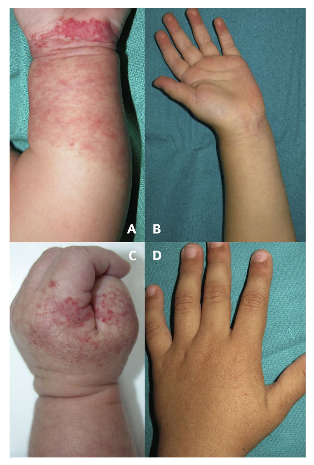
Figure 1 Abortive hemangiomas at the maximum point of growth and after regression. Segmental lesion on the forearm with minimal spread to the wrist at 45 days (A) and 3 years (B) of age. Partially segmental hemangioma on the hand at 45 days (C) and 4 years (D) of age.